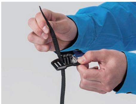
(1) Pass the belt through A from below.