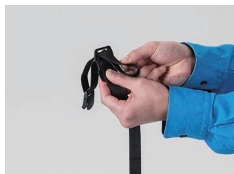
(4) Pass the belt through C from below.