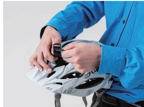
(10) Pass the belt through the buckle.