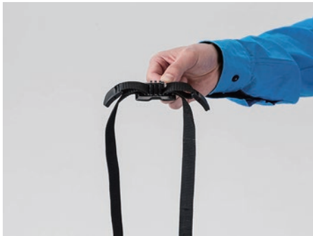
(6) Pass the belt through the openings on the opposite side.