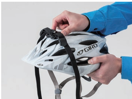
(8) Place the mount on the helmet.