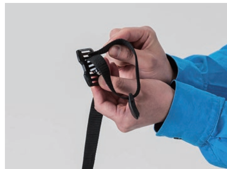
(3) Pass the belt through B from above.