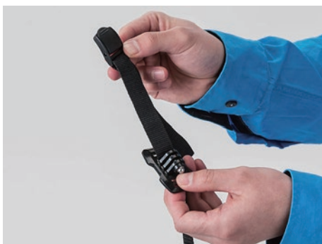
(2) Pass the belt through the buckle from above.