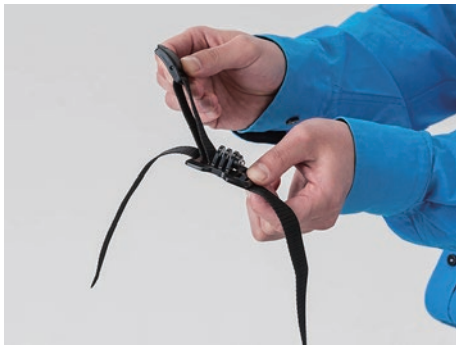
(5) Adjust the length of the belt.