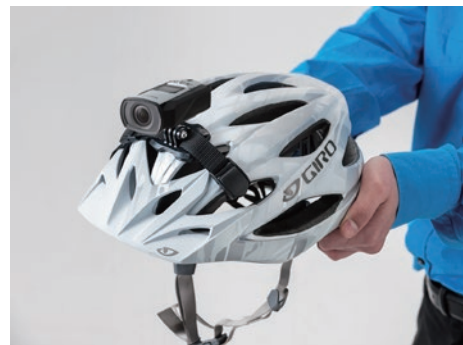
(11) Bolt the mount base and attach the camera.