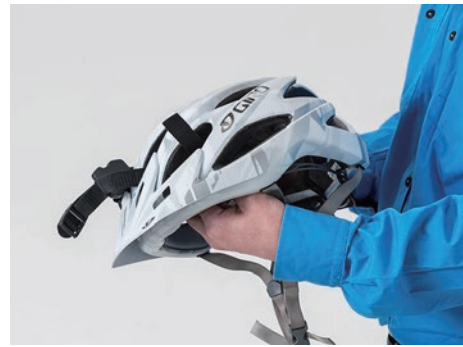
(9) Pass the belt through the helmet.