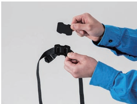
(7) Attach the rubber to the mount.